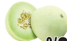
Honeydew Melon Melon Verde