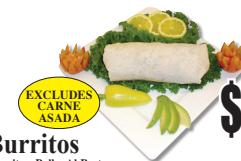
Burritos Carnitas, Pollo, Al Pastor