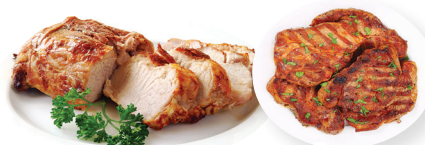
Fresh, Boneless Pork Loin Chops Loin Roast Chuletas de Puerco o Lomo de Puerco sin Hueso