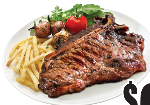
Fresh Beef T-Bone Steak Bistec de Hueso T de Novillo con Hueso