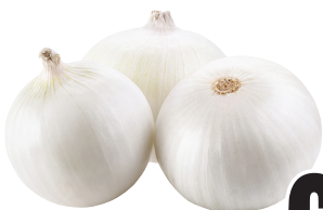
White Onions Cebolla Blanca