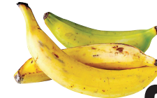
Plantain Banana Platano Macho