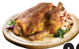
Whole Chicken Pollo Entero