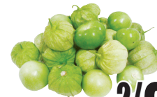
Fresh Tomatillo Tomatillo