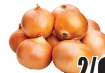
Brown Onions Cebolla Cafe