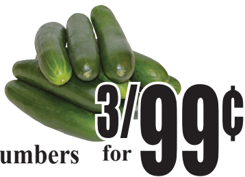
Cucumbers for Pepinos