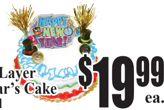
Double Layer New Year's Cake 8" Round