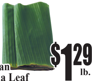
Mexican Banana Leaf