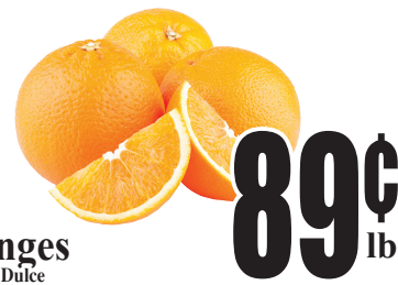
Sweet Oranges Naranjas Dulce