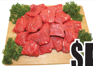
Fresh Beef Stew Meat