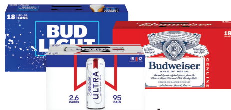
Budweiser, Bud Light 18 Pack, 12 oz. Cans or Bottles or Michelob Ultra 15 Pack, 12 oz. Cans