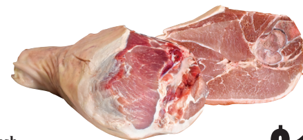
Fresh Pork Legs WHOLE OR HALF Pierna de Puerco Entero o a la Mitad