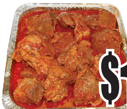
Birria de Novillo