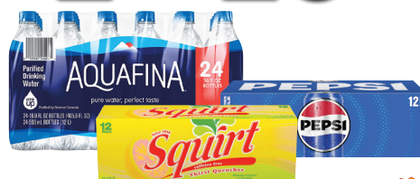
7up, Squirt, Sunkist, Pepsi, Diet, Mtn Dew, Manzanita Sol, Crush Assorted, 12 Pack, 12 oz. Cans or Aquafina 24 Pack, 16.9 oz. Bottles