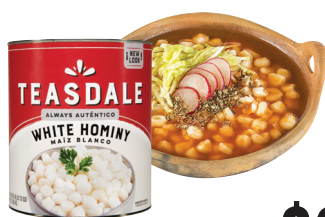
Teasdale White Hominy 108 oz.