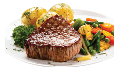
Fresh, Boneless Beef Shoulder Clod Steaks or Roast Espaldilla de Novillo sin Hueso