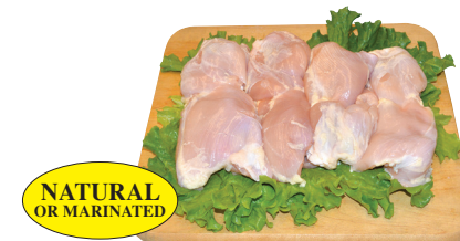
NATURAL OR MARINATED Fresh, Boneless Chicken Leg Meat Pierna de Pollo sin Hueso