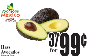
Hass Avocados for 3/99¢

ESPECIALES DE 3 DIAS • DICIEMBRE 27, 28 Y 29 SOLAMENTE