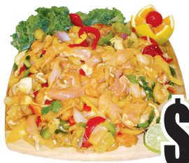
Fresh Chicken Fajitas