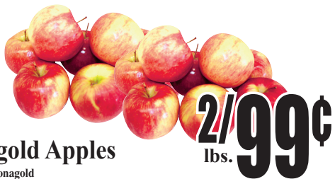
Jonagold Apples Manzana Jonagold