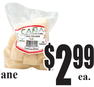
Sugar Cane Caña en Bolsa