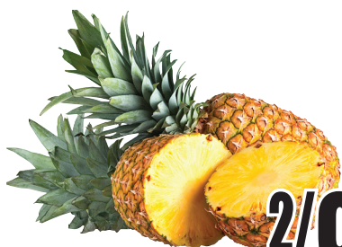
Sweet Pineapples Piña Dulce