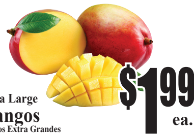
Extra Large Mangos Mangos Extra Grandes