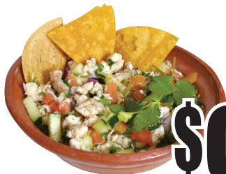
Fresh Shrimp Ceviche