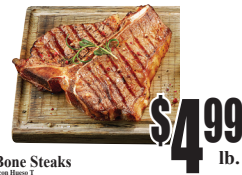
Fresh Beef T-Bone Steaks Entero de Novillo con Hueso $499 lb.