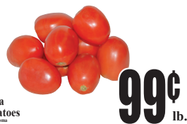
Roma Tomatoes 99¢ lb.