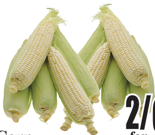
White Corn Elote Blanco Fresco