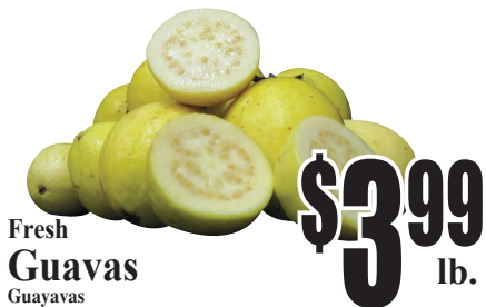
Fresh Guavas Guayavas