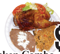
1/2 Chicken Combo with Rice, Beans, Corn Tortillas and Salsa