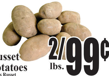
Russet Potatoes Papas Russet