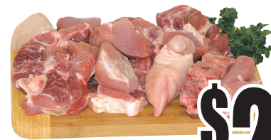
Fresh Pork Pozole Mix