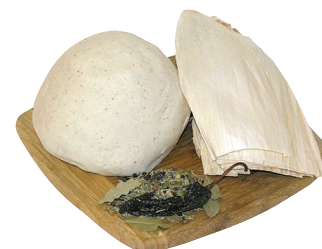
Masa Preparada para Tamales