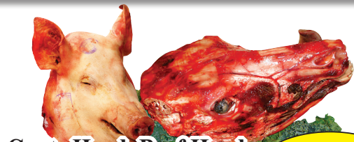
Goats Head, Beef Head or Pork Head