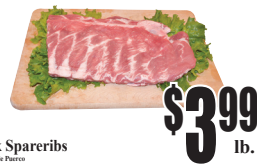
Fresh Pork Spareribs Costilla de Puerco $399 lb.