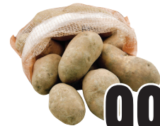
5 Lb. Bag Russet Potatoes Papas Russet en Bolsa