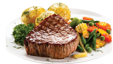
Fresh, Boneless Beef Shoulder Clod Steaks or Roast Espaldilla de Novillo sin Hueso