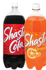
Shasta Cola Assorted, 2 Liter