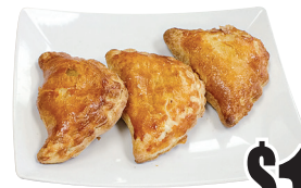
Empanadas de Cajeta