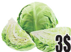
Green Cabbage Repollo Verde