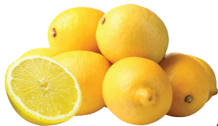
Yellow Lemons Limon Amarillo