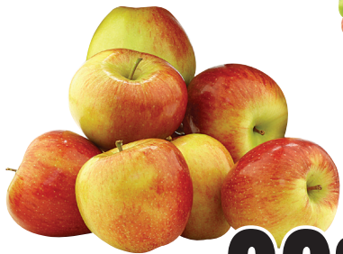
Braeburn Apples Manzanas Braeburn

Granny Smith or Fuji Apples Manzanas Verde o Rojo $1.29 lb.