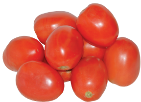
Roma Tomatoes Tomate Roma