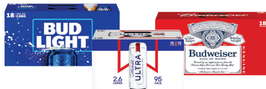
Budweiser, Bud Light 18 Pack, 12 oz. Cans or Bottles or Michelob Ultra 15 Pack, 12 oz. Cans