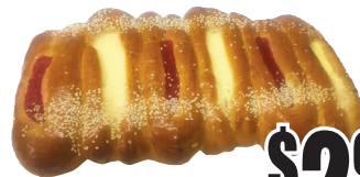
Pan de Feria