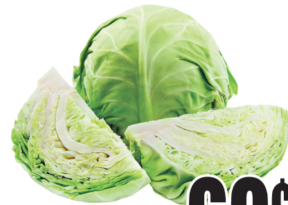
Green Cabbage Repollo Verde