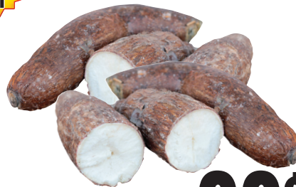
Fresh Yucca Roots Raíz de Yucca