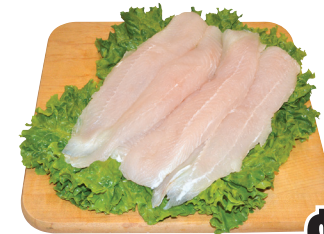
Swai Basa Fish Fillet Filete de Basa