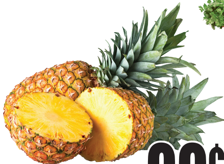
Sweet Pineapples Piña Dulce