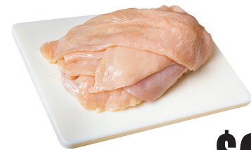
Thin Sliced Chicken Breast Fillets Filete de Pechuga de Pollo