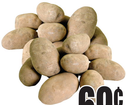
Russet Potatoes Papas Russet