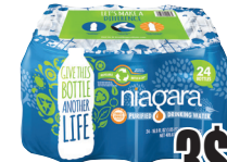
Niagara Water 24 Pack, 5 Liter Bottles